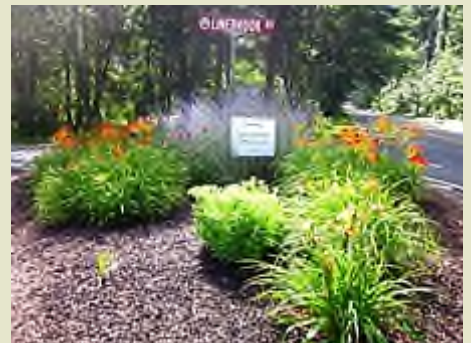
Linebrook Road Island