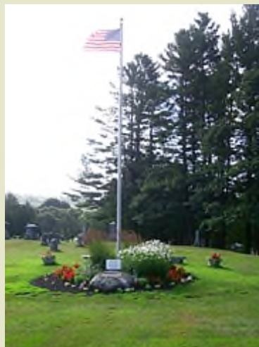
Pine Grove Cemetery in August