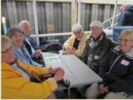
Merrimack River Cruise May 22, 2018