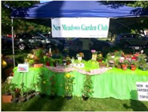
Strawberry Festival 2018