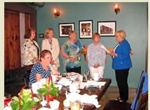
Our club's new officers are installed