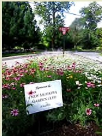
Prospect Street Island